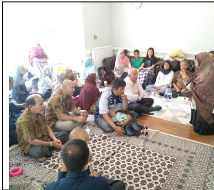
Oxford, UK, 2018