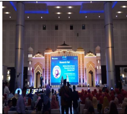
ISEF 2018, Surabaya